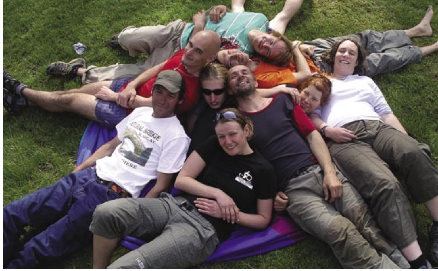
Remembering how to play, to share, and to be spontaneous were at the heart of this course.

attitudes and way of working. In the Czech Way, as with other experiential courses, there is clearly potential for manipulation, but unlike many UK courses one measure of the success of a course is the intensity and authenticity of dialogue between the staff team and the students. Staff themselves were mature people, authentic, honest, and determined to try to make some more sense of their own world, within and through the above mentioned dialogue in which values, attitudes, and habits were shared, questioned and re-assessed. This dialogue is a key part of a Dramaturgy and for us helped establish a partnership between the staff team and the students so that together we could continue to co-creating the course experience.